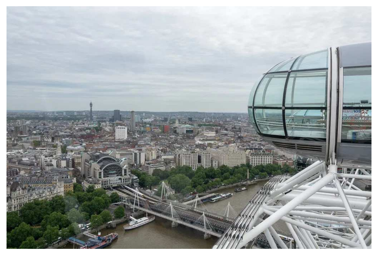
"London Eye, London, England" by dconvertini is licensed under CC BY-SA 2.0