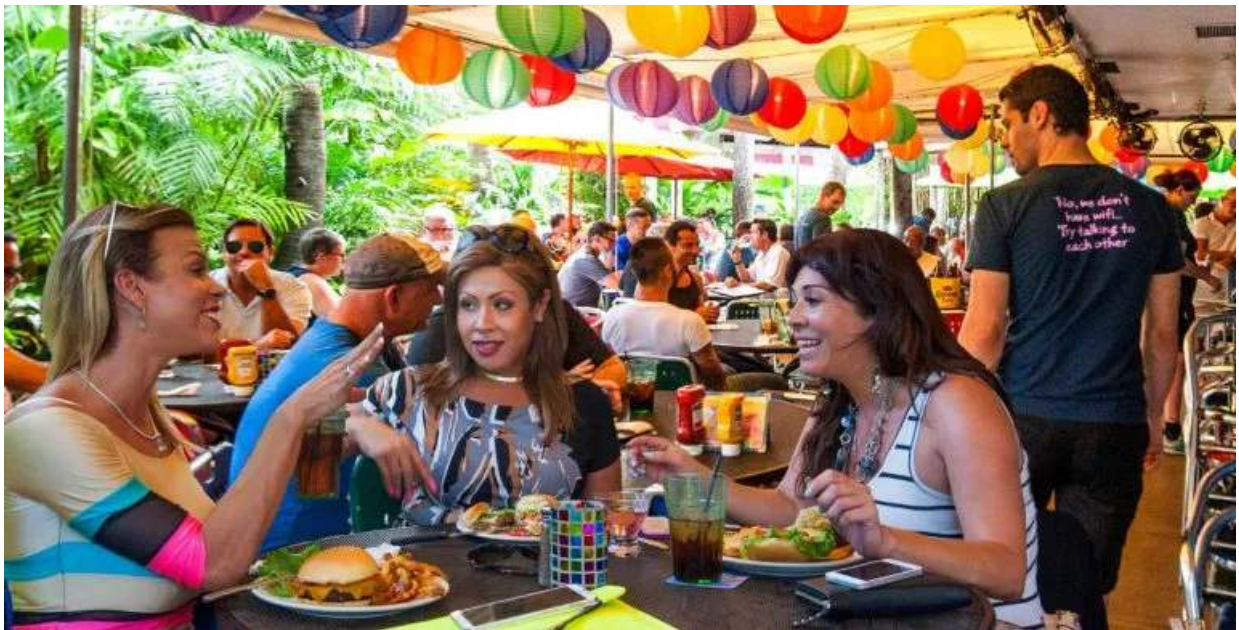
Rosie's Bar & Grill

The Yard – An urban oasis in Wilton Manors amid beautiful Rainbow Eucalyptus trees hosts a variety of cafes and restaurants all with great outdoor seating. Favorites include Voo La Voo, Seed of Life Vegan Restaurant, Chateau D'vine Wine, Beer & Tapas and more. Take in the beauty of The Yard's murals while enjoying your time shopping, eating and relaxing.