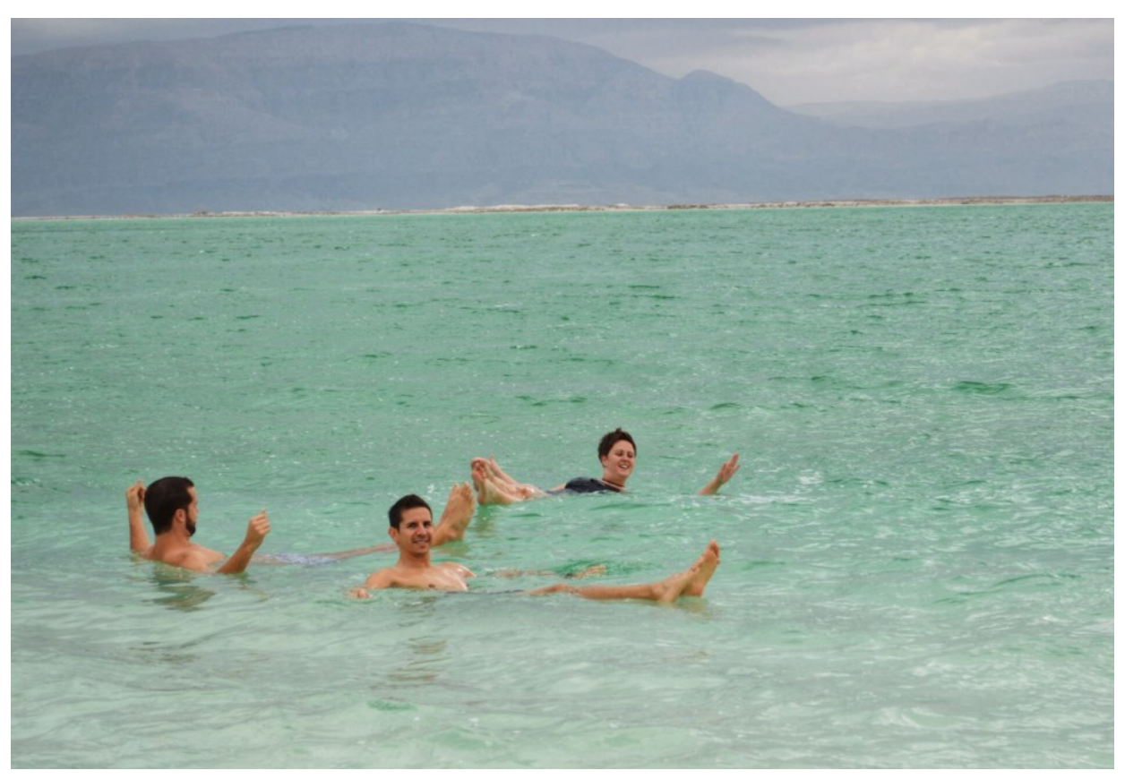
Floating in the Dead Sea

Haifa – you can head north to Haifa to visit the Baha'i Temple Gardens with 19 stunning terraces built alongside Mount Carmel.