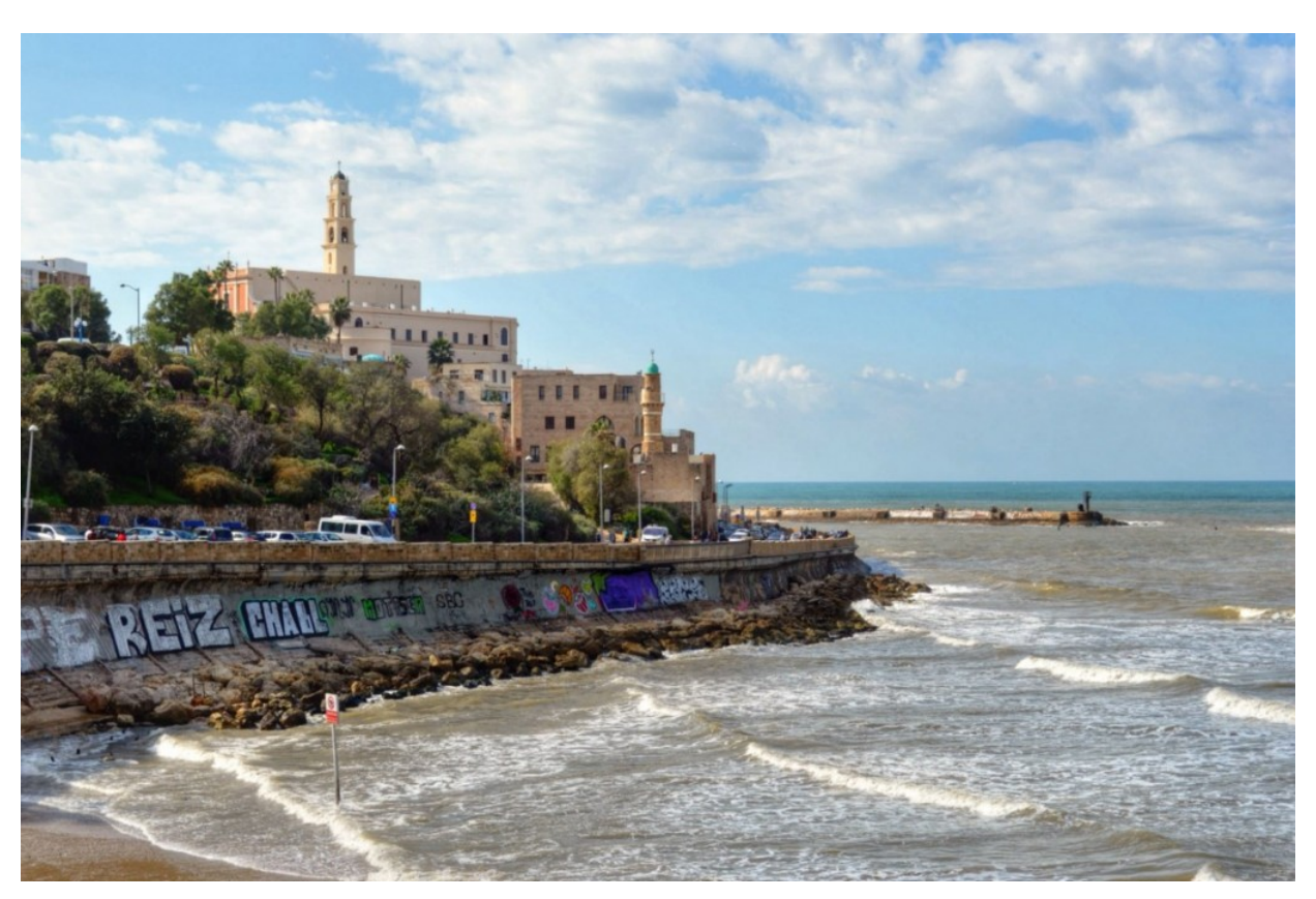
Jaffa Old Town

Jaffa Flee Market – head up to the Jaffa flee market to enjoy the sights, smells and sounds of a bustling street marketplace. Browse the offerings and enjoy a freshly made falafel or sabich for lunch and later buy yourself a cool and freshly squeezed orange or pomegranate juice from one of the many street vendors.