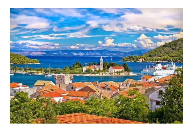
DAY 7 / Wednesday, August 31: VIS & VINOGRADSE BAY / HVAR

Breakfast and lunch on the boat. Depart Korcula and sail to Vis. We will depart early to get a head start on the day's activities and to secure a berth on the very popular town quay, so you can hop on, hop off your private yacht. You can take an excursion to the Blue Caves, Green Caves & Stiniva Bay. Bring your camera for amazing pics. Once we are done with the action-packed stuff, we are off to the town of Vis where you can take a wine tour, military tour or just wander the streets at your own leisure. Enjoy swimming, paddleboarding, exploring the old town, cocktail bars, traditional tavernas or cocktails onboard. Overnight on the boat.