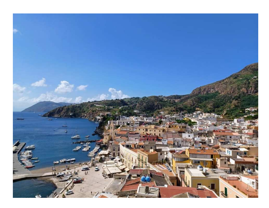
DAY 5 / Wednesday, July 12: SALINA

Malvasia. Spend the day venturing around the town and the lush landscape before a sunset dinner admiring the view towards smoldering Stromboli volcano.