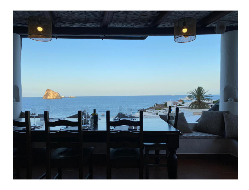
DAY 8 / Saturday, July 15: PORTOROSA

You'll enjoy a delicious breakfast and morning swim before you slowly journey back to the port where you started the trip. Stopping along the way at some beautiful off-the-beaten track bays, you'll make sure you soak it all in. Once you arrive back, spend the evening on the beach or by the pool before settling in for a final night on your catamaran.