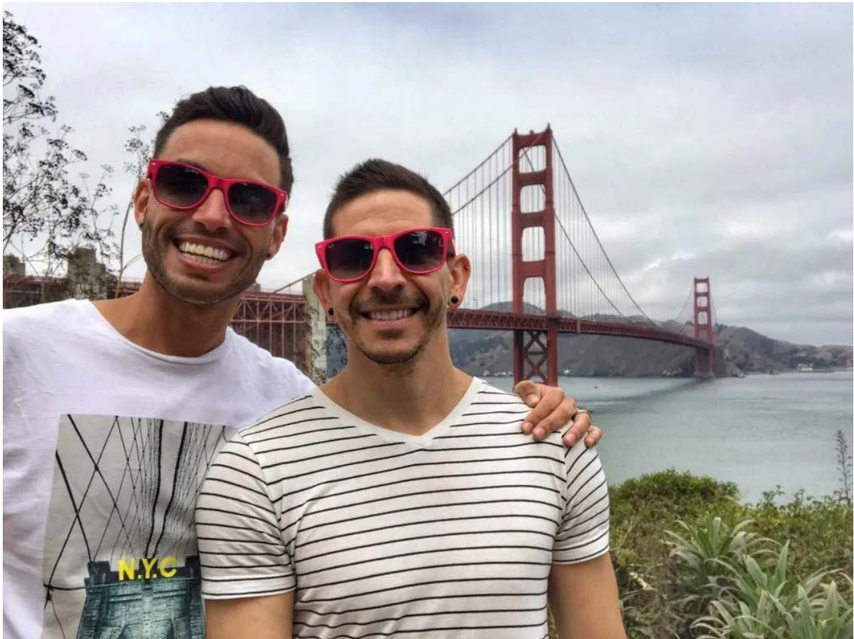
Golden Gate Bridge.....duh! :-)

Beaches – the north end of Baker Beach is the gay, clothing-optional beach. It's known for great views of the Golden Gate Bridge (weather permitting of course). To get there take the #38 Geary Outbound and transfer to the #29 Sunset Bus. Near Baker Beach is Marshall's Beach which is also popular for gay and nude sunbathers. Again, it has excellent views of the bridge as well, but with a bit of a trek to get there. Take bus #30 North and get off at Golden Gate Bridge Toll Plaza. From there it's about a 15-minute walk.