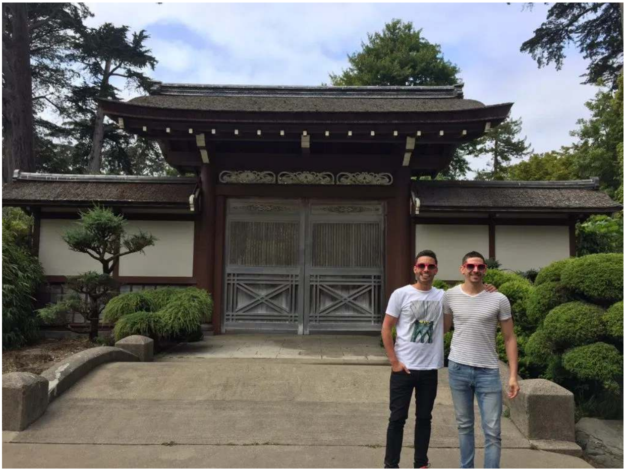
Japanese Garden at Golden Gate Park