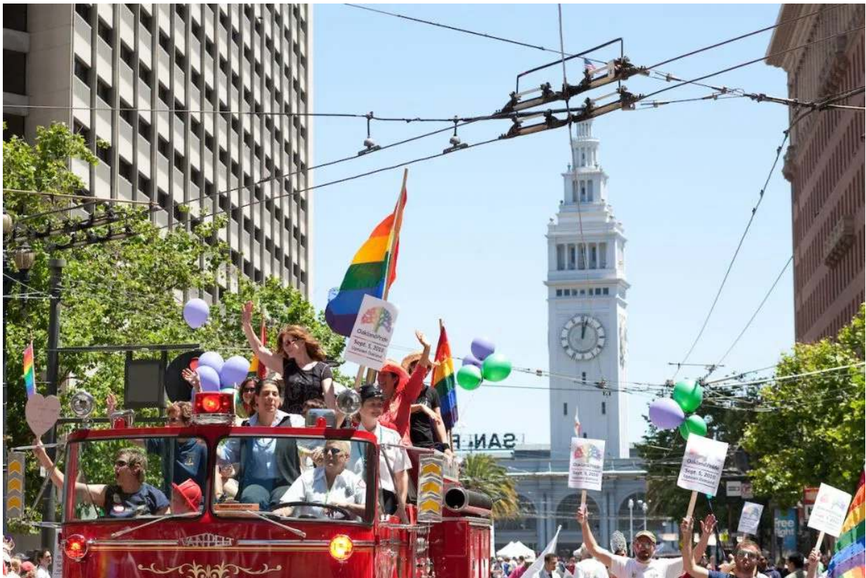
The 40th Annual San Francisco Gay Pride Parade where the theme was “Forty and Fabulous” in San Francisco, Calif. on Sunday June 27, 2010.

San Francisco Pride – this gay pride event started back in 1970 and today it is the largest gathering of the queer community and its allies nationwide. The event, held annually during the last full weekend of June, has more than 200 parade contingents and exhibitors and over twenty community-run stages and venues like Homo Hip Hop to Gray Pride. Things get started on Saturday at the Civic Center Plaza downtown and the Parade occurs on Sunday morning.