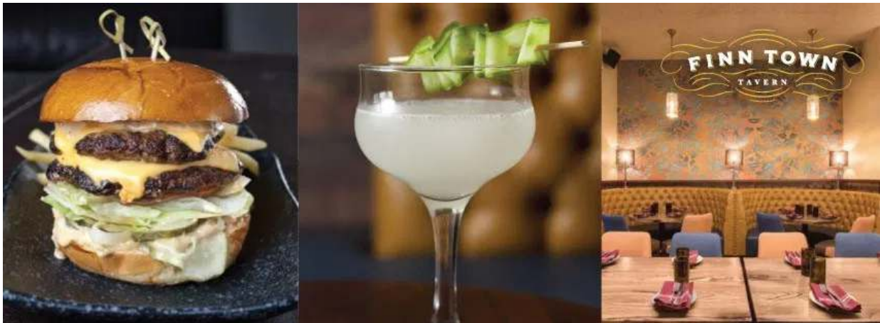
Delicious eats at Finn Town Tavern in the heart of the Castro

The Castro – this neighborhood’s assorted foodie scene ranges from tapas to Mexican to classic American. For comfort food in the heart of the Castro District, Finn Town Tavern provides nightly dinner, fun signature drinks like “Show Girl” and “Drop Dead Diva” and most importantly, weekend brunch. Be sure to enjoy the libations during their Monday – Friday happy hour. For an order-at-the-counter, authentic Mexican treat try sopes, tostadas or horchata at Tacorgasmico .