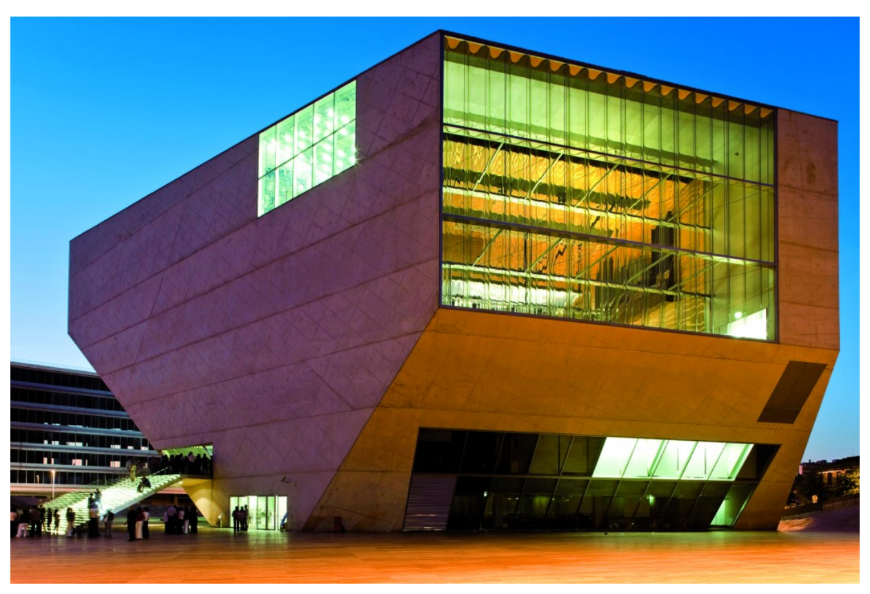
Casa de Musica, Photo Credit: Porto Convention and Visitors Bureau CC BY-NC-ND – Associação de Turismo do Porto e Norte, AR

Livraria Lello – if you love books, one of Portugal's oldest bookstores is a must see.