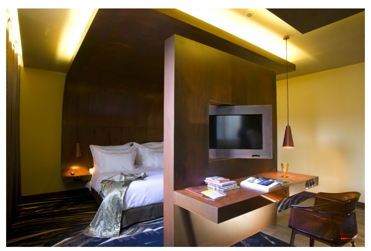
Hotel Teatro Suite Room

Hotel Infante Sagres – still luxurious, this hotel is a tad on the smaller side of most luxury accommodations. The charming, boutique hotel, however, lacks absolutely nothing when it comes to comfort, allure, and spaciousness. Expect a glass of port upon arrival.