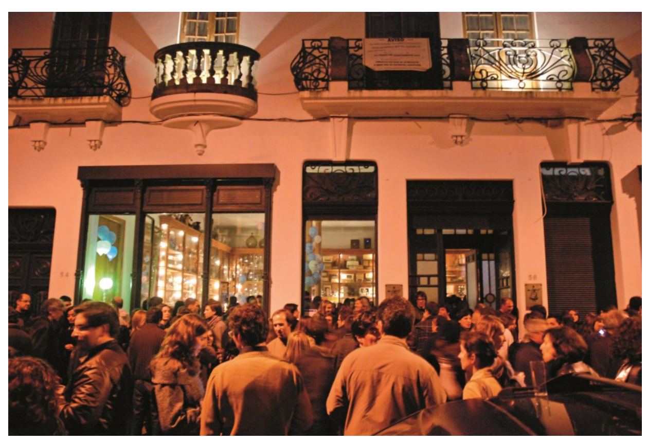
Nightlife at Galleries, Photo Credit: Porto Convention and Visitors Bureau CC BY-NC-ND – Associação de Turismo do Porto e Norte, AR

Lusitano Café – great bar with a mixed crowd built in a former warehouse with incredibly high ceilings. It starts to get busy around midnight and has an open atmosphere with more of a socializing scene. Address: Rua de José Falcão 137, 4050-317