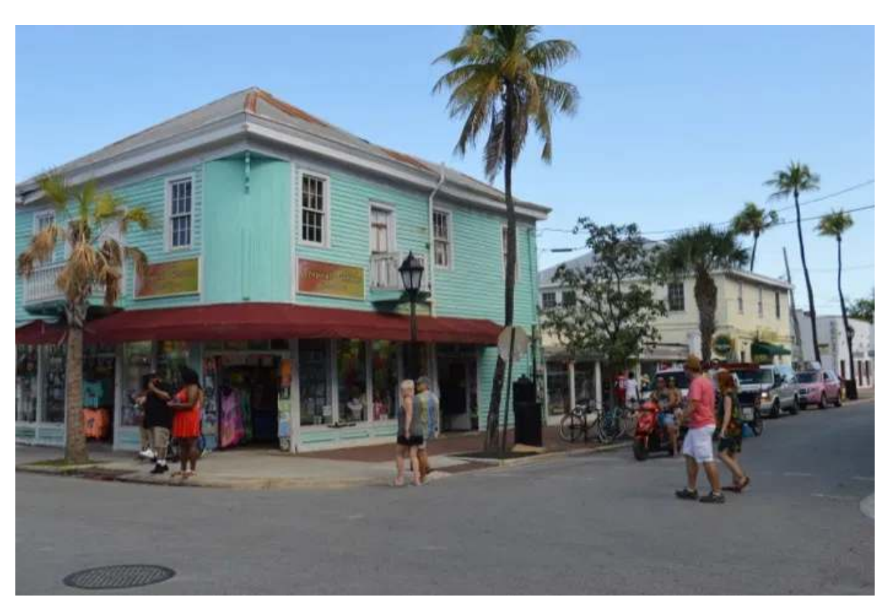
Gay Beaches in Key West

1 Saloon – The only gay leather bar in Key West. It's a historical local bar with late hours, drink specials, live entertainment and an outdoor patio.