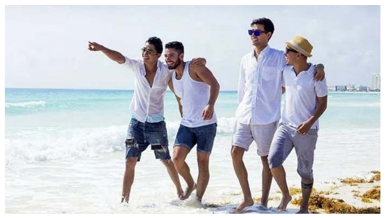
Gay Events in Puerto Rico

There are also a number of beaches in and around the city, but you'll find Atlantic Beach is where the gays gather – mostly in front of Oceano, a gay-owned restaurant and beach hang out. Ocean Park nearby is also gay-friendly, but it tends to be full of younger crowds and college students. You probably want to keep any public displays of affection to moderate level. During the daytime in the gay-friendly areas you shouldn't have any problems with your partner, but like anywhere, just use your best judgment and be cautious of who's around you.