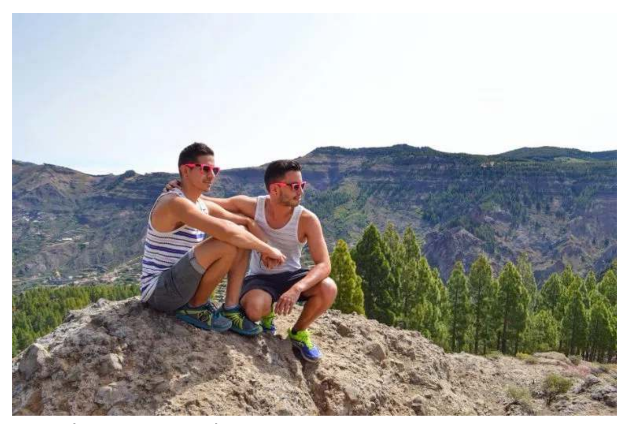
Gay Hotels & Resorts in Maspalomas

There are plenty of gay accommodations in and around Maspalomas. The gay beach is great to catch a tan but having a (clothing optional) pool right next to your room is also convenient for lazy days as the beach can be a bit of a trek to get to. Choosing one of the many gay-friendly accommodations in Maspalomas will ensure a wonderful stay during your holiday.