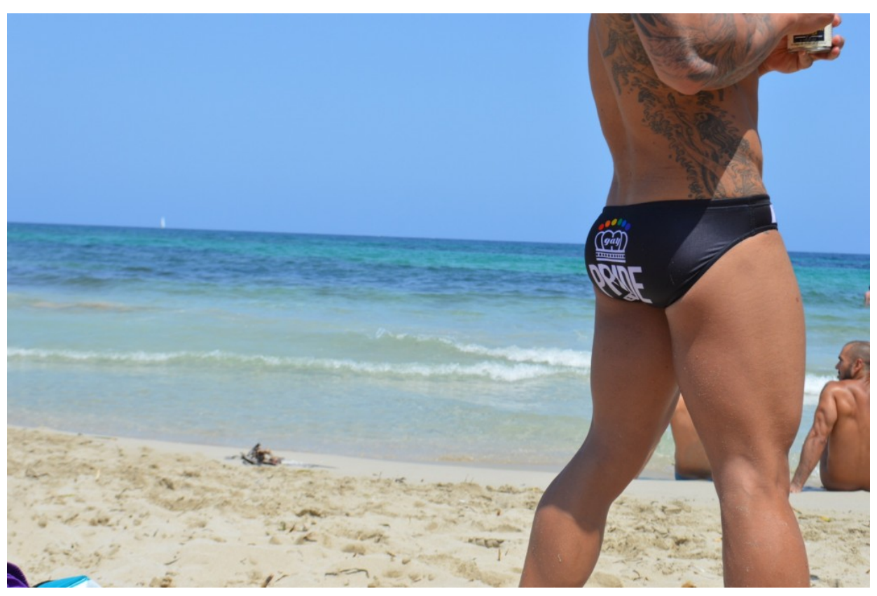
Mr. Gay Pride Ibiza 2015 (yes he has a cute face too!)