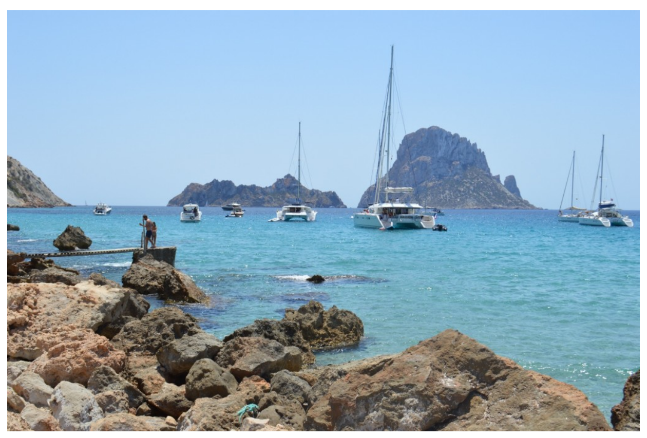
Amazing view from El Carmen Restaurant