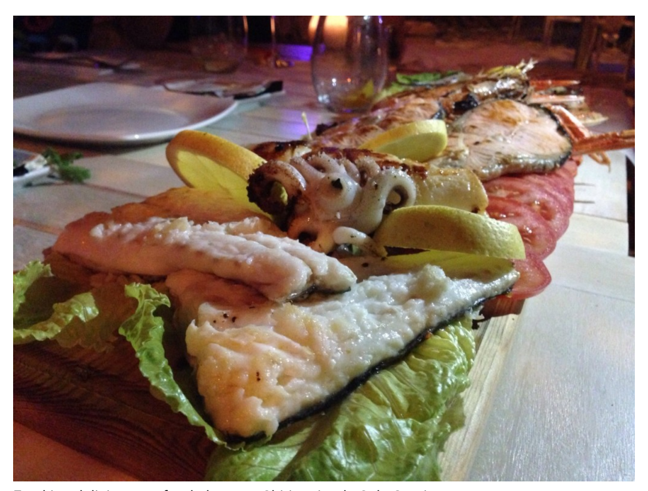
Freaking delicious seafood platter at Chiringuito de Cala Gracioneta

Savannah – with a gorgeous terrace overlooking a rocky coast and bright blue waters, this restaurant in San Antonio is very well situated and perfect for a nice lunch if you're on this side of the island. Their menu offers a variety of delectable and affordable dishes from around the world including seafood, woks, and Brazilian and Argentine meats. Again, the cava sangria is a must.